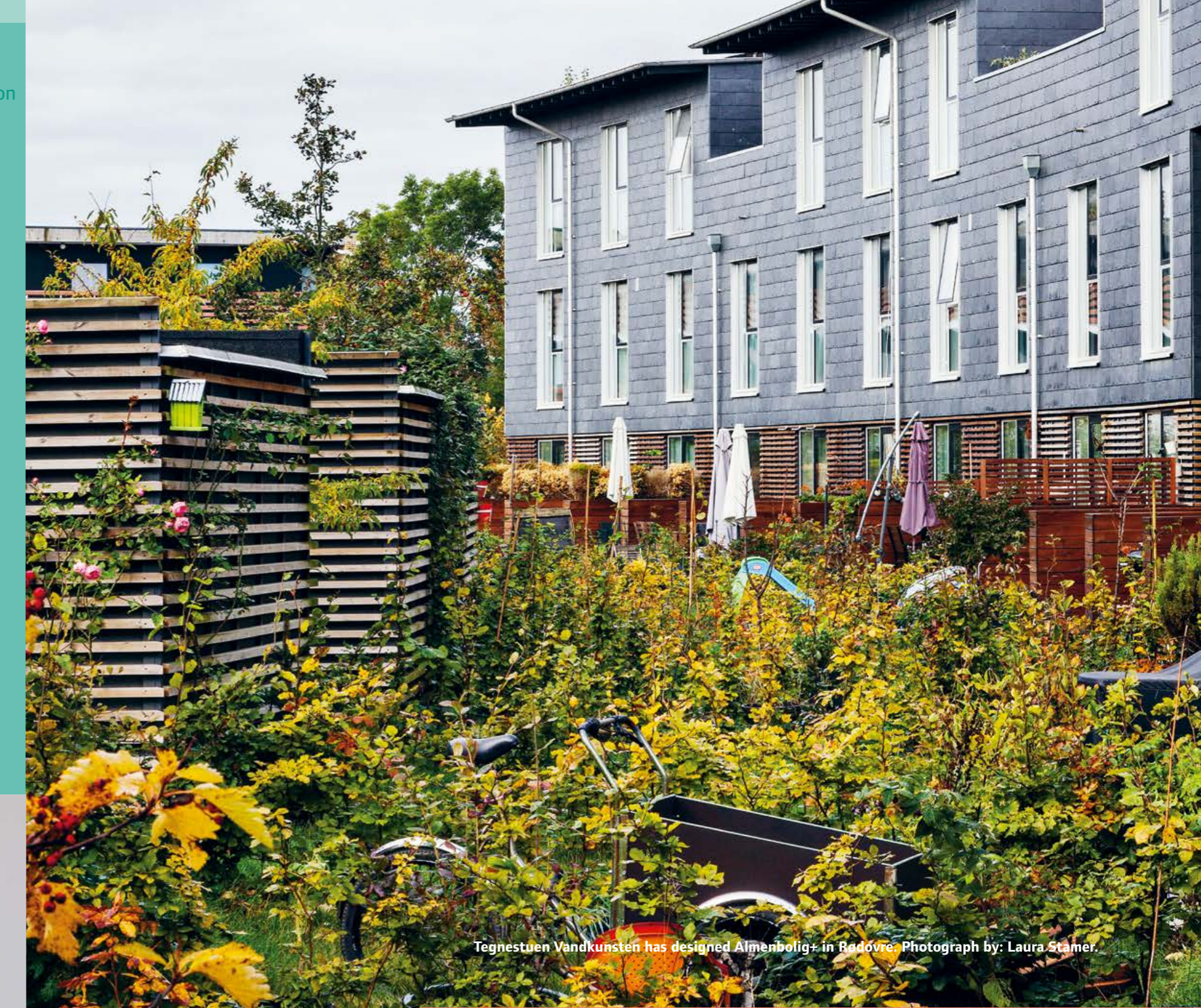
Tegnestuen Vandkunsten has designed Almenbolig+ in Bedovre.

We want to help ensure that everyone, all over Denmark, can get a loan to buy a home or grow their business. We believe that the challenges facing the rural districts must be met with joint solutions – through a sustainable rural alliance, across trade organisations, agriculture, the mortgage sector, the government and the political parties.